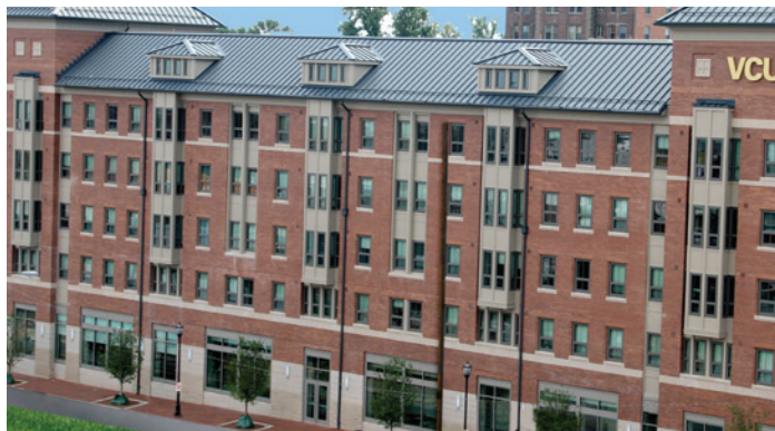
West Grace Student Housing, Virginia Commonwealth University Richmond, Virginia WINDOW INSTALLER Burgess Snyder, Virginia Beach, Virginia

TR-9100/9700 Single-Hung Side-Load Thermal Windows include a sash design with a full-width integral lift rail at the sill for easy operation. Two convenient lock handles are also included at the sill for one-motion opening. Additionally, operating friction is reduced with special weather strips. AAMA Class 2 block-and-tackle balances with extruded aluminum housings and AAMA Class 5 heavy-duty spring balances with larger frame jambs are available as options.